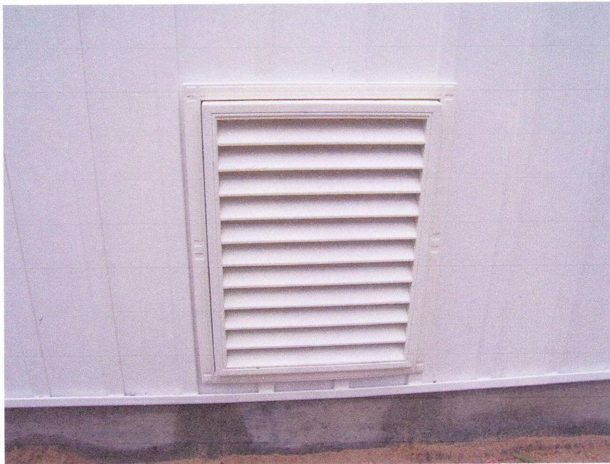
Typical Flood Vent (Photo Taken April 16, 2015)