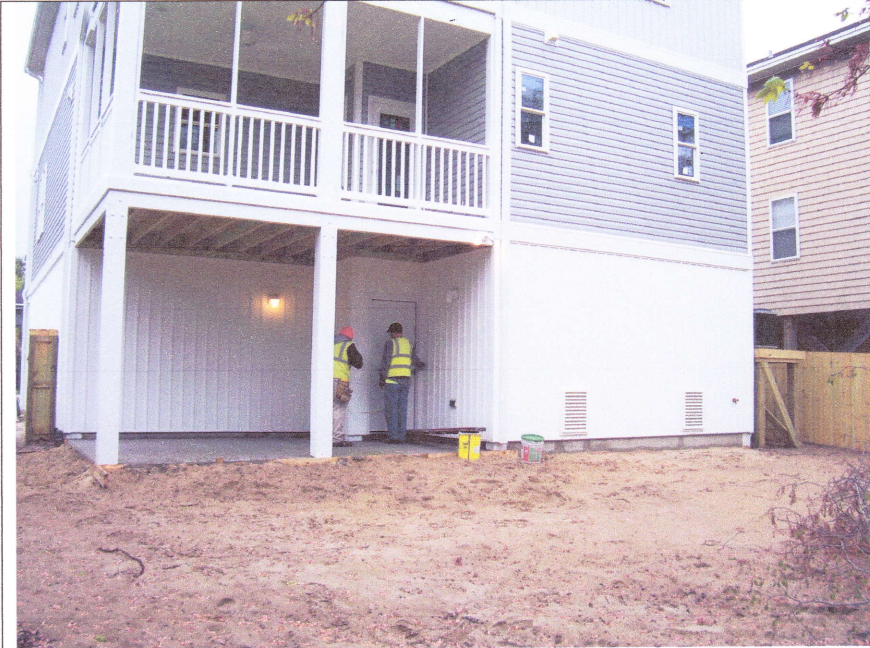
Rear View (Photo taken April 16, 2015)

If submitting more photographs than will fit on the preceding page, affix the additional photographs below. Identify all photographs with: date taken; "Front View" and "Rear View"; and, if required, "Right Side View" and "Left Side View." When applicable, photographs must show the foundation with representative examples of the flood openings or vents, as indicated in Section A8.