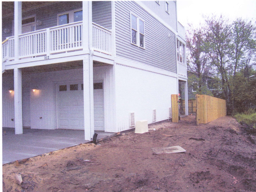
Right Side View (Photo taken April 16, 2015)