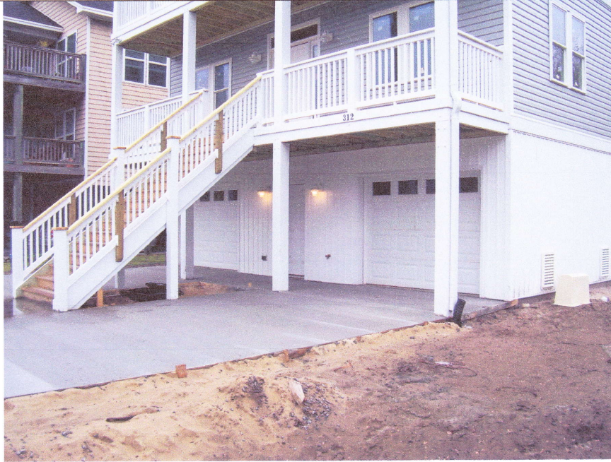
Front View (Photo taken April 16, 2015)

If using the Elevation Certificate to obtain NFIP flood insurance, affix at least 2 building photographs below according to the instructions for Item A6. Identify all photographs with date taken; "Front View" and "Rear View"; and, if required, "Right Side View" and "Left Side View." When applicable, photographs must show the foundation with representative examples of the flood openings or vents, as indicated in Section A8. If submitting more photographs than will fit on this page, use the Continuation Page.