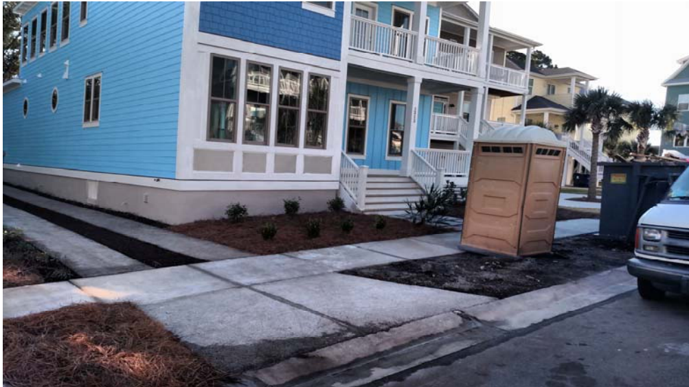
Front view 2-09-2016

If using the Elevation Certificate to obtain NFIP flood insurance, affix at least 2 building photographs below according to the instructions for Item A6. Identify all photographs with date taken; "Front View" and "Rear View"; and, if required, "Right Side View" and "Left Side View." When applicable, photographs must show the foundation with representative examples of the flood openings or vents, as indicated in Section A8. If submitting more photographs than will fit on this page, use the Continuation Page.