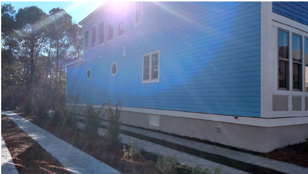
Left side view 2-09-2016