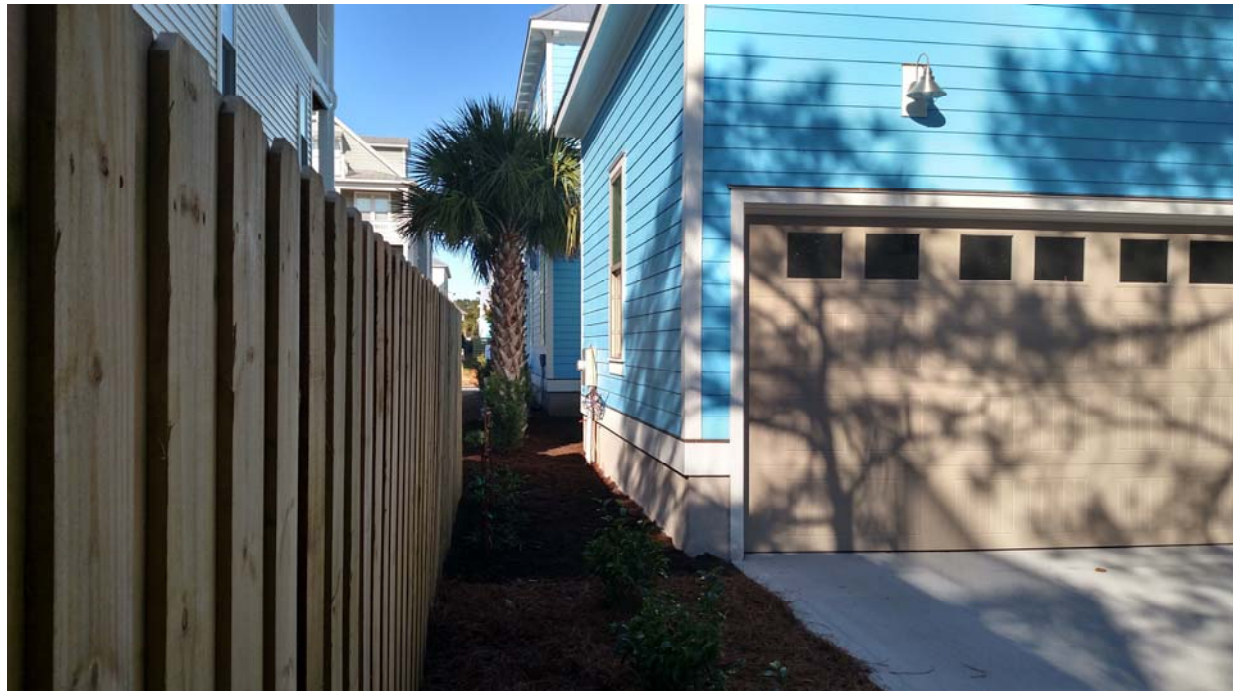
Right side view 2-09-2016