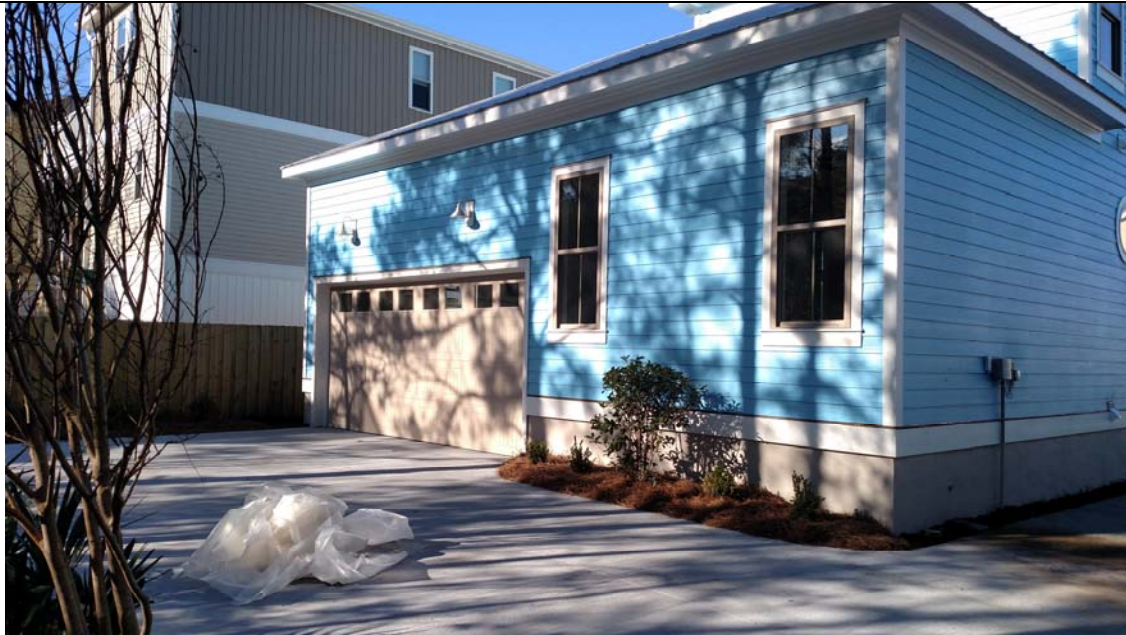
Rear View 2-09-2016

If submitting more photographs than will fit on the preceding page, affix the additional photographs below. Identify all photographs with: date taken; "Front View" and "Rear View"; and, if required, "Right Side View" and "Left Side View." When applicable, photographs must show the foundation with representative examples of the flood openings or vents, as indicated in Section A8.