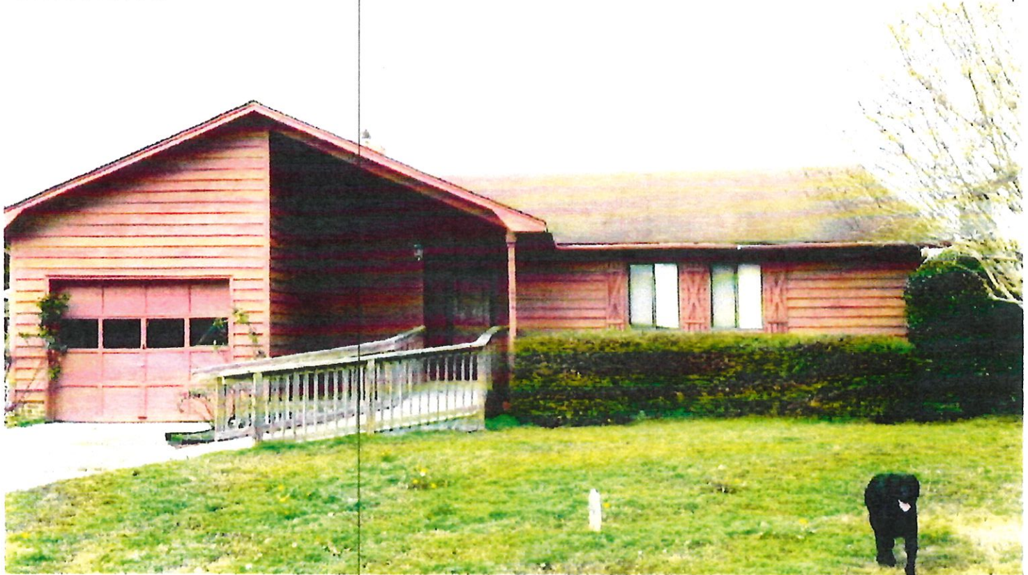
Front View 12/31/13

If using the Elevation Certificate to obtain NFIP flood insurance, affix at least 2 building photographs below according to the instructions for Item A6. Identify all photographs with date taken; "Front View" and "Rear View"; and, if required, "Right Side View" and "Left Side View." When applicable, photographs must show the foundation with representative examples of the flood openings or vents, as indicated in Section A8. If submitting more photographs than will fit on this page, use the Continuation Page.