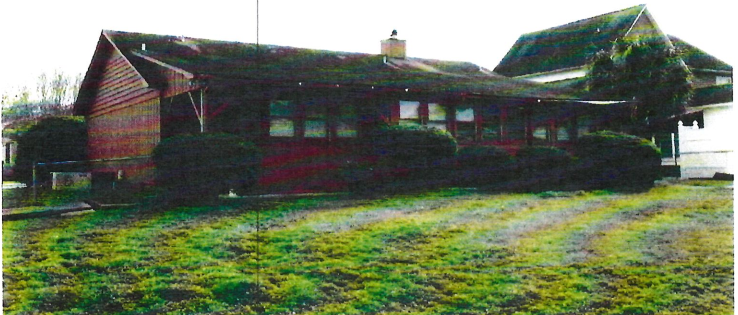
Rear View – 12/31/13

If submitting more photographs than will fit on the preceding page, affix the additional photographs below. Identify all photographs with: date taken; "Front View" and "Rear View"; and, if required, "Right Side View" and "Left Side View." When applicable, photographs must show the foundation with representative examples of the flood openings or vents, as indicated in Section A8.