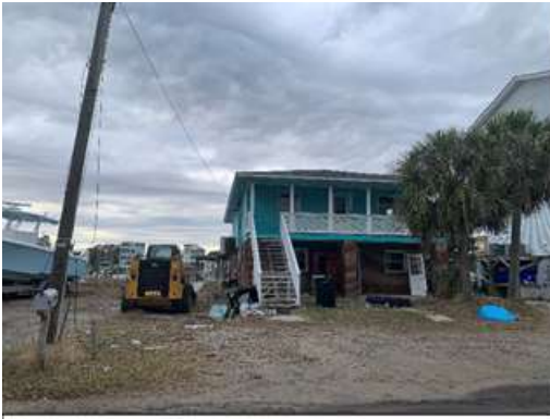
Demolition – 707 Canal Drive – CAMA Minor Permit issued for redevelopment