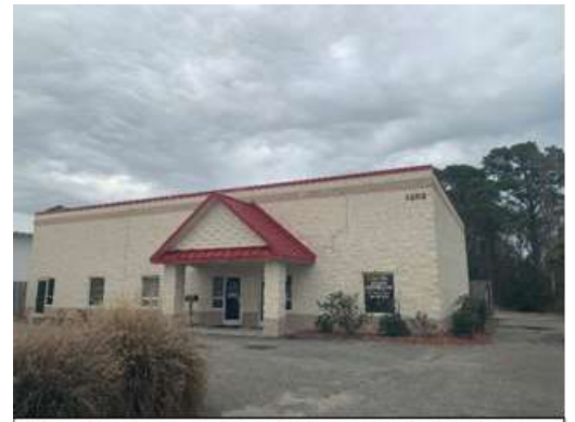
New Business – 1202 N Lake Park Blvd. – Four Hounds Distillery expansion applied for