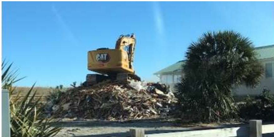
Demolition of 308 Carolina Beach Ave N in progress for re-development of Mixed-Use structure.