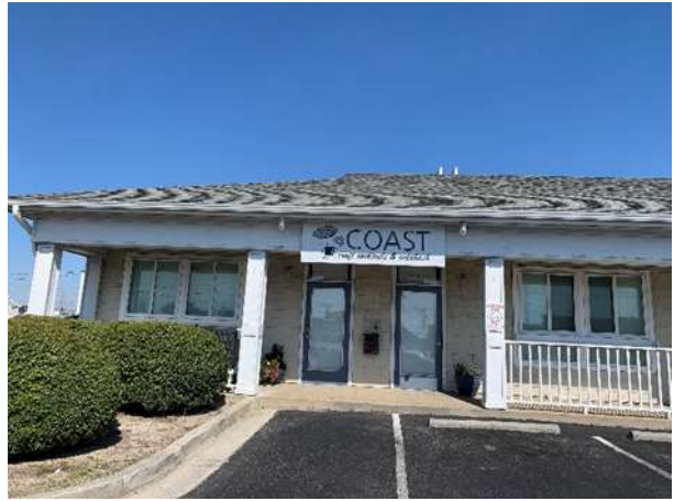
604 Lake Park Blvd N – Shangri-La Restaurant (application rec'd)