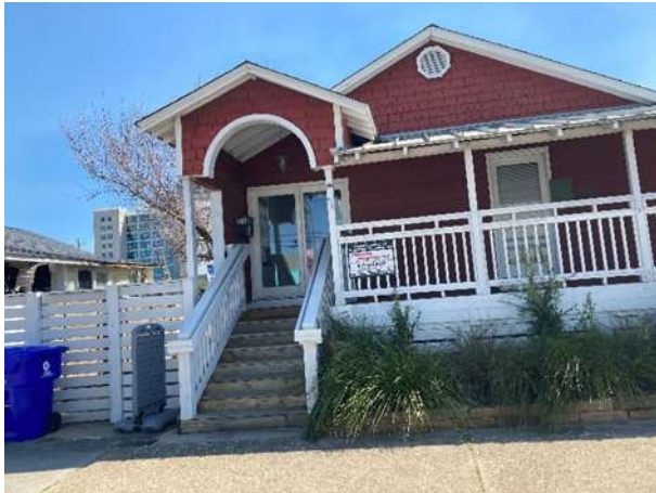
103 Lake Park Blvd S – Sandspur (application rec'd)