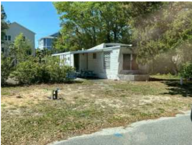
911 Blanche Ave.