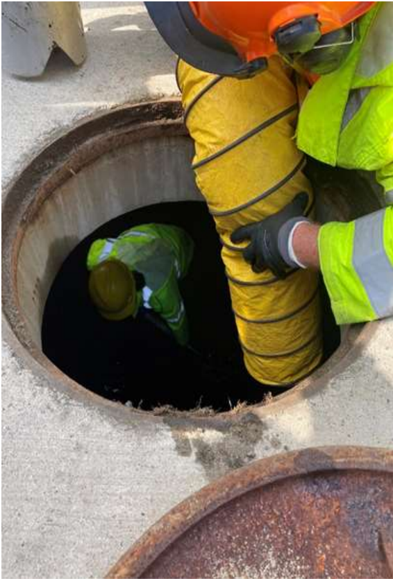
Crews leaning out sediment vault at Atlanta and 3 rd Ave.