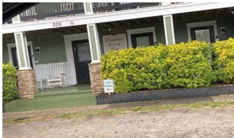
Notified owner regarding designated parking in Harper ROW at Carolina Inn

Parking in right-of-way clarification for Carolina Inn: