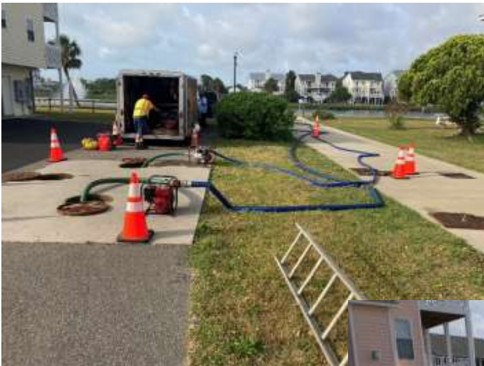
Crews removing water before entering in sediment vault to perform inspection. 3 rd St and Atlanta Ave