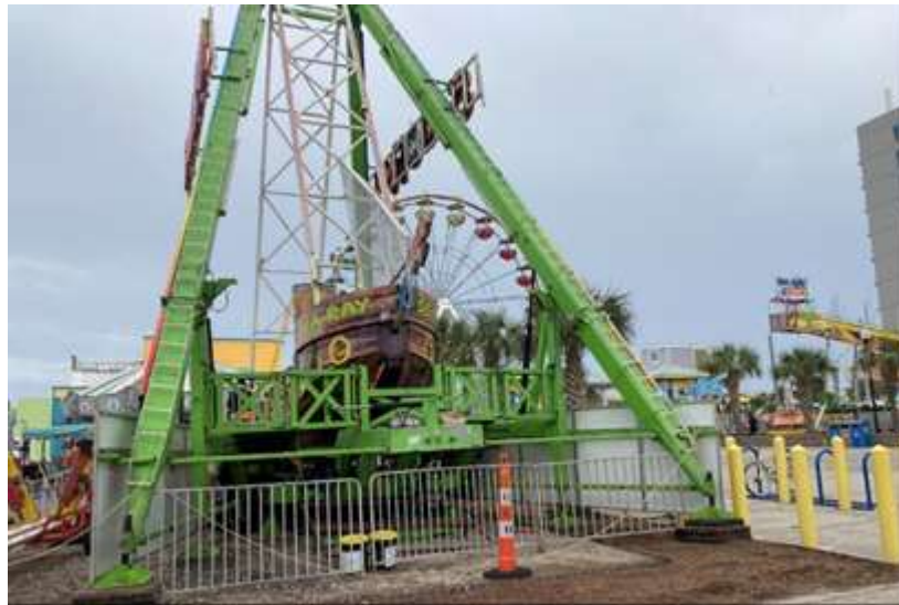
Rides Being setup at the Boardwalk

Parking in right-of-way clarification for Carolina Inn: