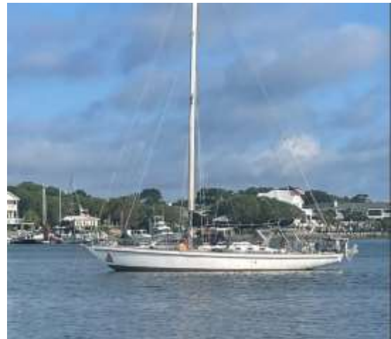
Anchored transient boat

Stayed for 5 days, May 8-12, 2022. Heavy-duty mooring balls and pendants with plastic ring on top of ball to protect topsides. No wake zone which is respected. USCG patrol passes through the harbor often. Two public dinghy docks and within walking distance are lots of restaurants, groceries, hardware stores, etc. Could not have felt more safe and secure. Bravo Carolina Beach!