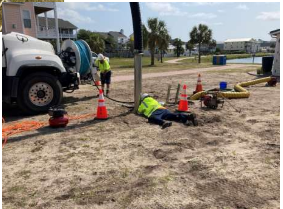
Crews clean out manholes at 4 th St and Clarendon at Lake Park.