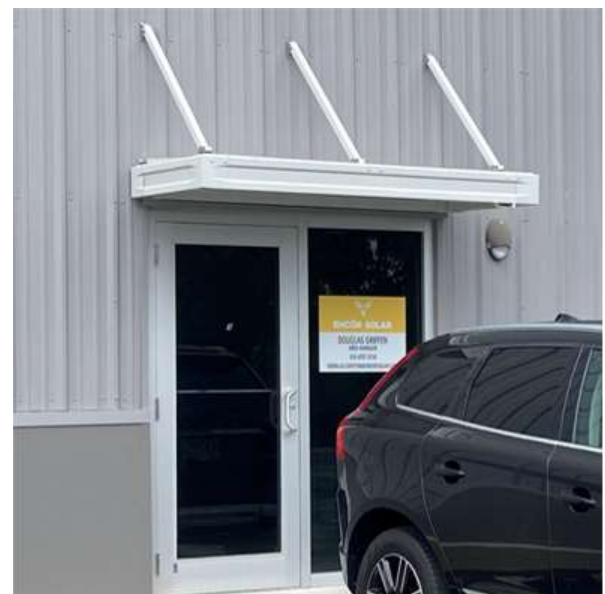
1326 Lake Park Blvd N Ste 3 – Encor Solar