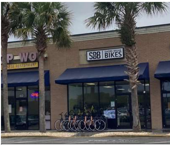
1401 Lake Park Blvd N Ste 44 – CB Bikes and Fitness – New owner