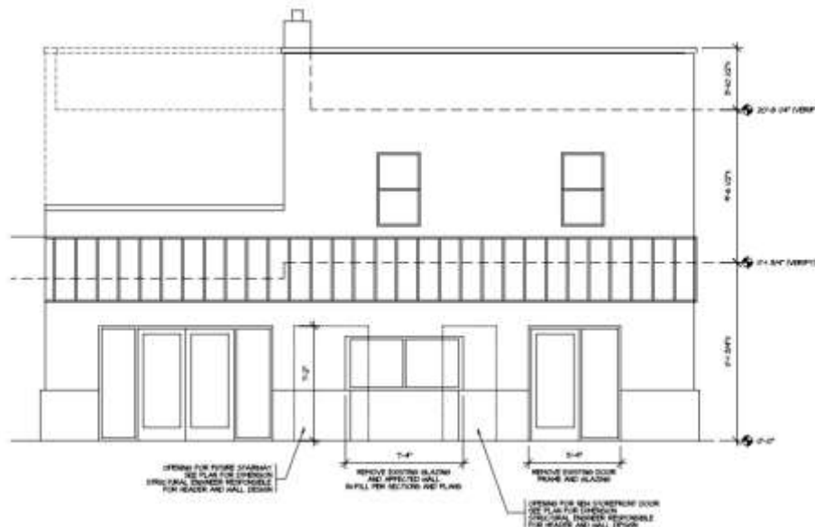
2 CBAN for new business