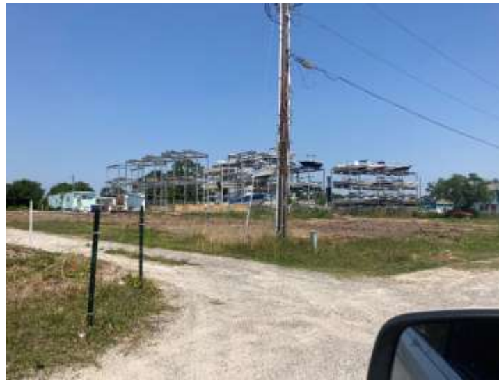
905 Basin-mobile homes