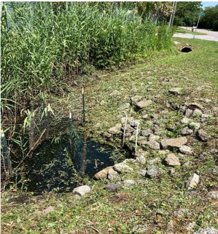
Crews clean out trash rack at St. Joseph St.