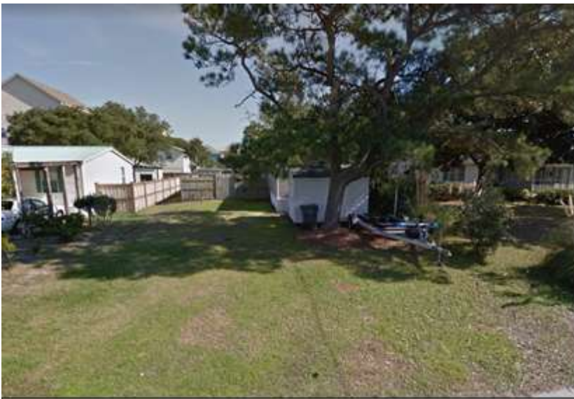
Demo: 1517 Bonito – Removal of fence and outdoor shower