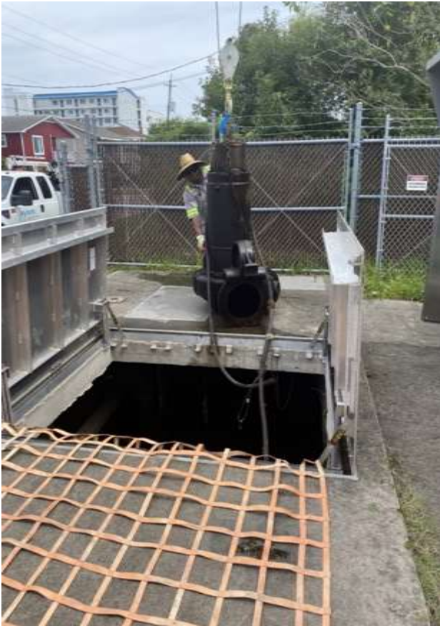
Contracted annual pump inspection/maintenance completed.