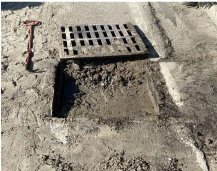
Crews remove sand from storm basins after King tide on Canal Dr.