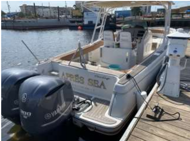
30' Chis Craft