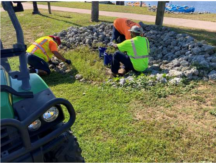
Crews clean out BMP at the lake.