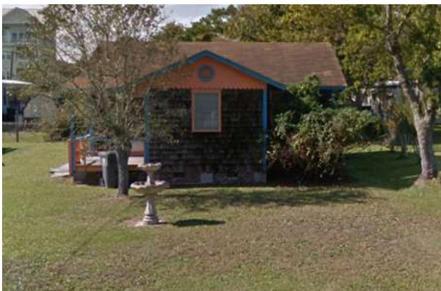
1416 Swordfish – single-family home