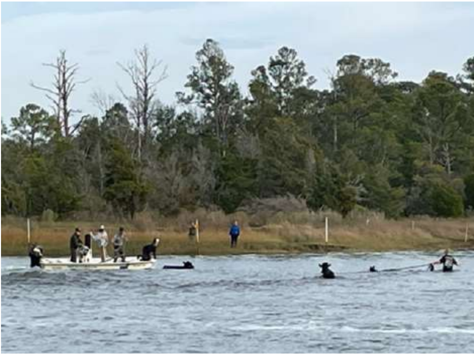
Cows on the run