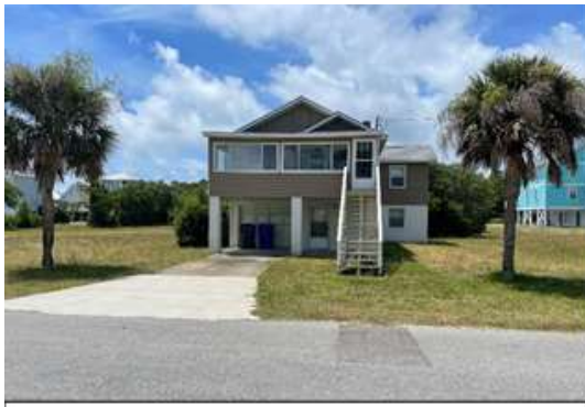
Demolition: 205 Spartanburg – Single Family Home