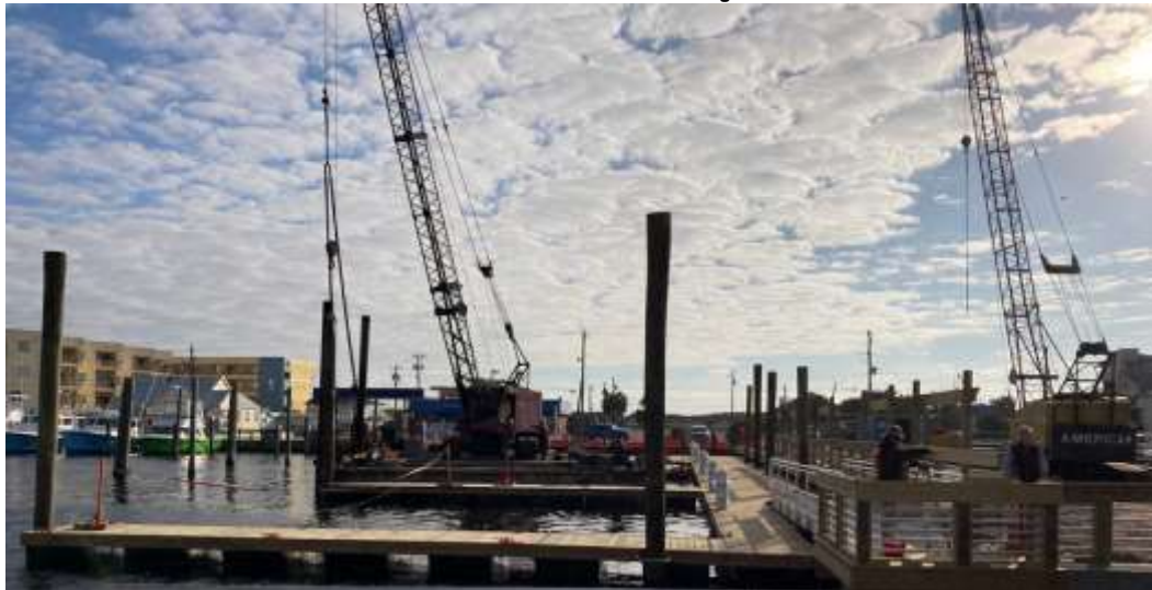
Marina Construction Progress