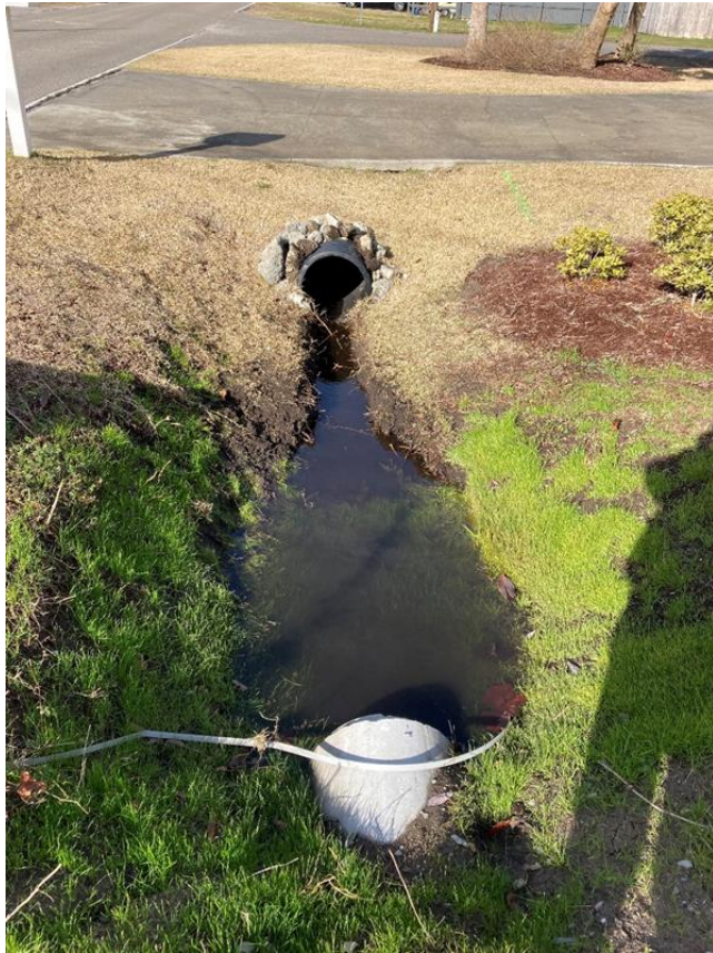
Crews reprofiled ditches at the and 200 block of Ocean Blvd.