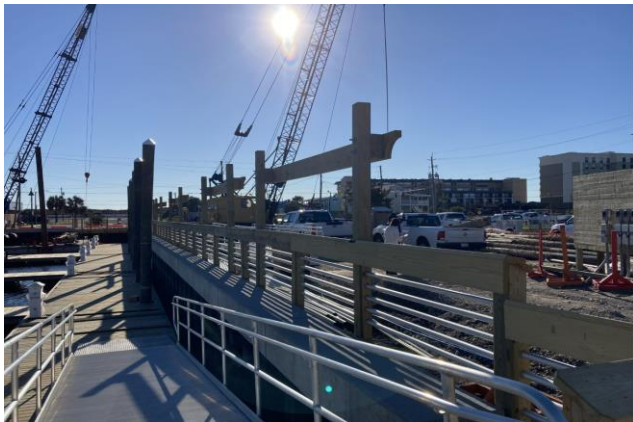
Marina Construction Progress