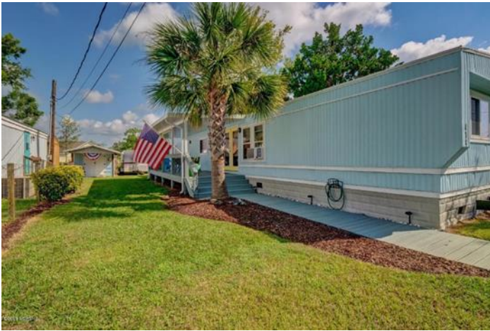
414 Goldsboro Ave (mobile home)