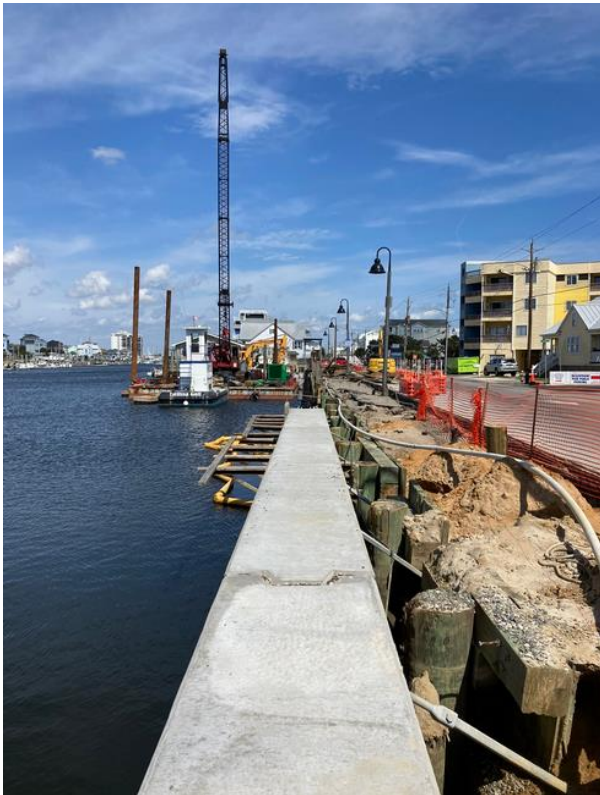
Marina construction progress: east side