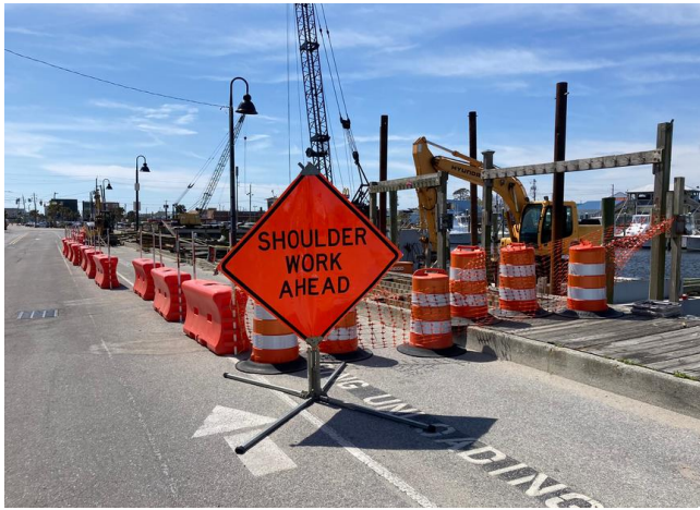
Marina construction progress: east side