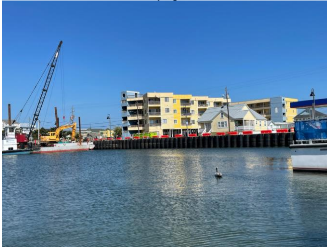
Marina construction progress: east side