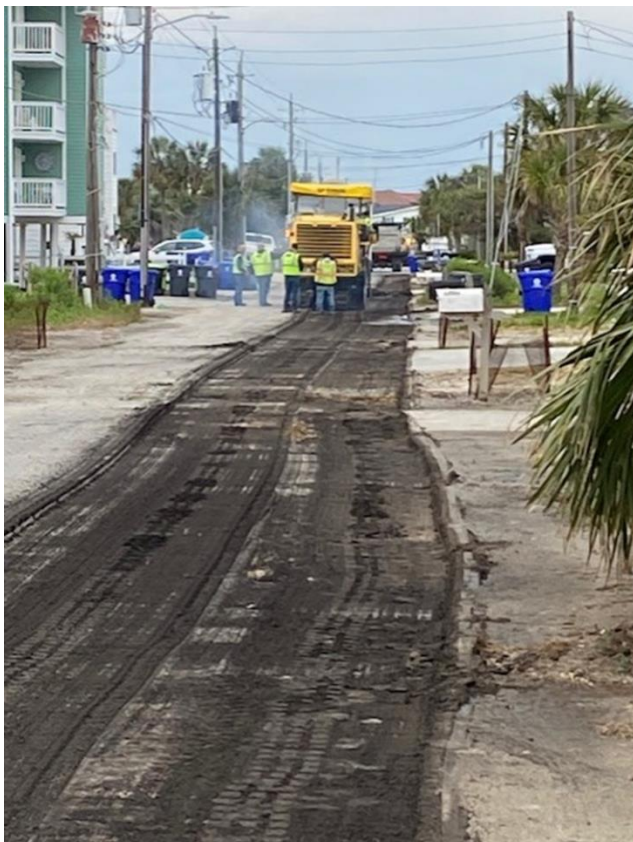
Paving project on Florida Ave