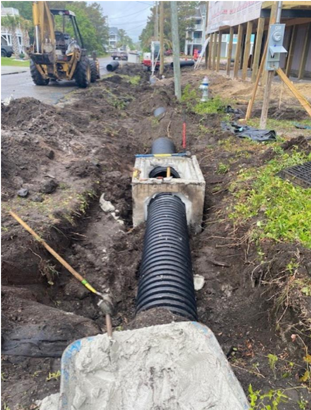
Contracted crews upgrade stormwater system at Greenville Ave. and 2 nd Street South