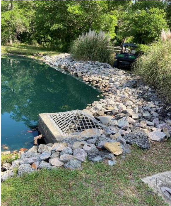
Town crews performed maintenance on the Town Hall stormwater pond