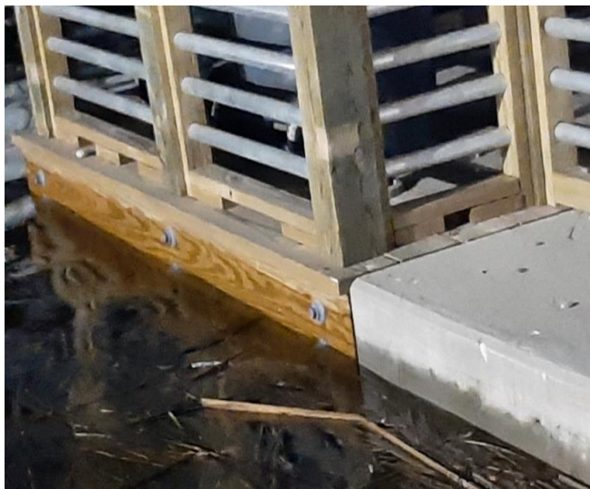
Water level at Town Marina during King Tide