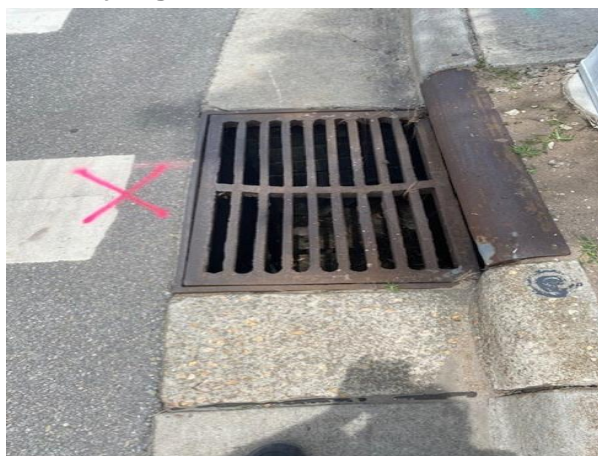
NCDOT notified of bicycle road hazard with old style grates on Lake Park Blvd S