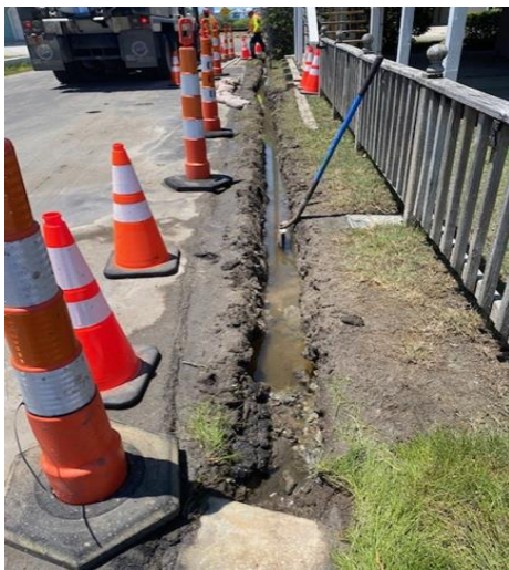
Crews corrected stormwater Issue on Sand Dollar Lane