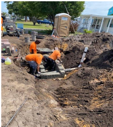
Contract crews update storm water at 1500 block of Bonito Ln