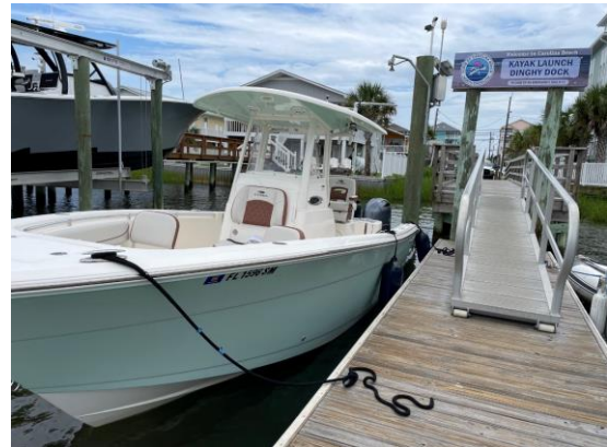
Boat parked at dinghy dock