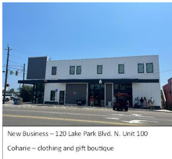
New Business – 120 Lake Park Blvd. N. Unit 100 Coharie – clothing and gift boutique