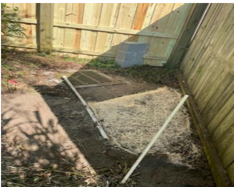
Crews completed stormwater repairs on Lewis/Teakwood Dr. easement.