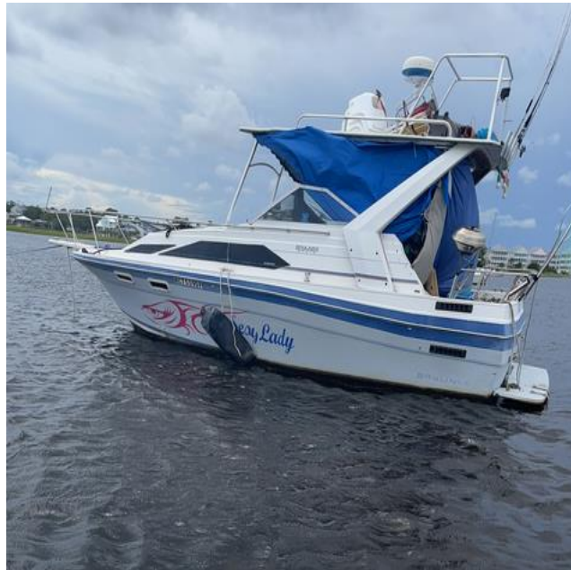
Boat in violation of Harbor ordinances