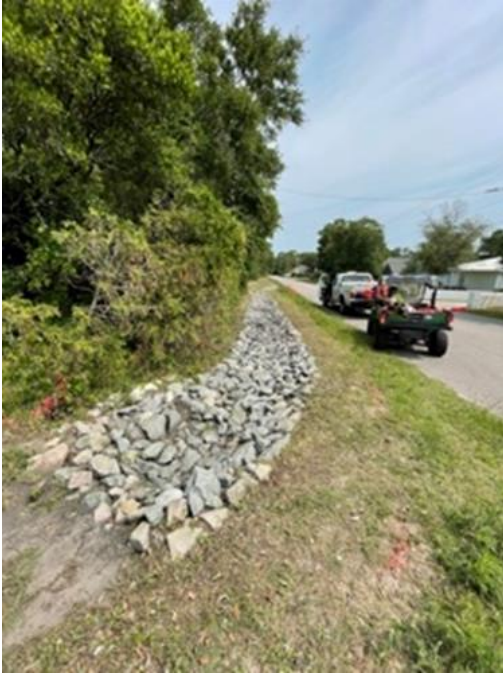
Town crews corrected stormwater issue on the 400 block of Spencer Farlow.