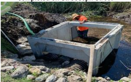
Stormwater upgrade was completed on St. Joseph Street