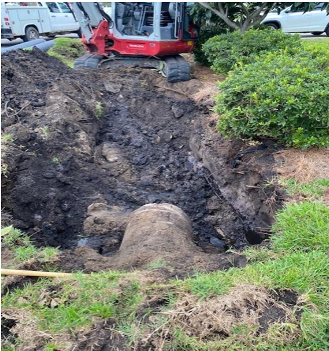
Contractor upgraded SW system on 8 th St. S.