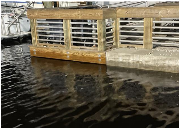
King Tide water level at high tide.