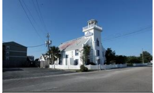
Event Venue / Bar – Kindred Weddings and Events – applied at 205 Charlotte Ave