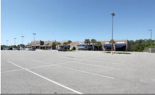
Bicycle Retail – iRide CB – moving to 1401 Lake Park Blvd N Ste 44