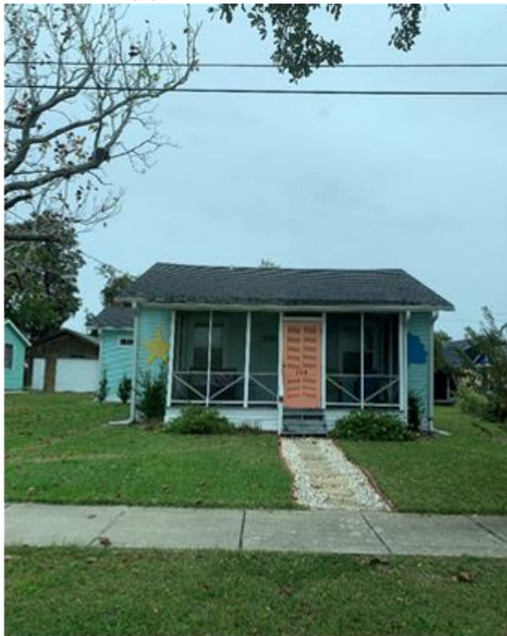
Demos: 308 Raleigh – Single family home