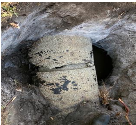
Crews begin sink hole repair at 1417 Bonito Ln.