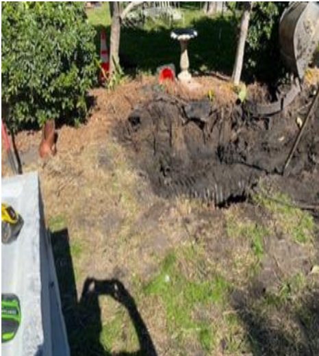
Crews working on sinkhole repairs at 5 South 8th St.