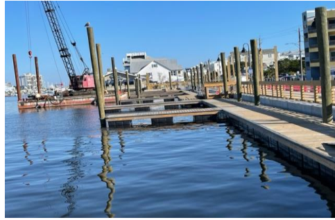
Marina Project: East side