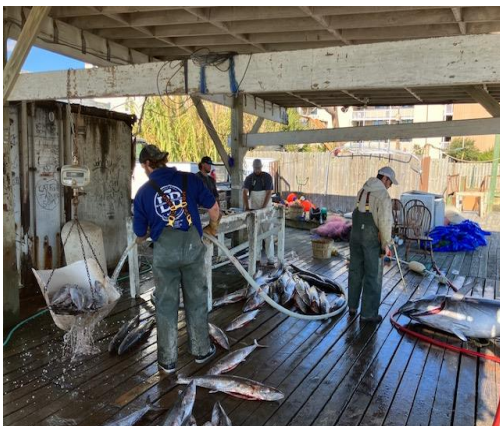
Commercial fishing vessels bring in King Mackerel and Blue Fin Tuna to CB market.