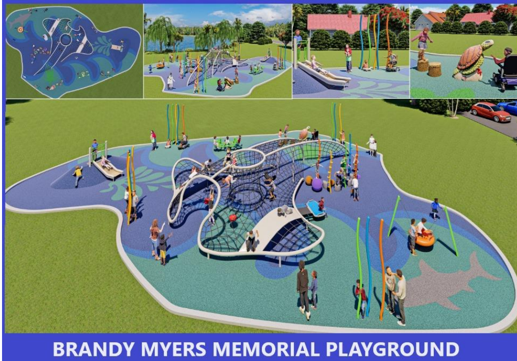
BRANDY MYERS MEMORIAL PLAYGROUND