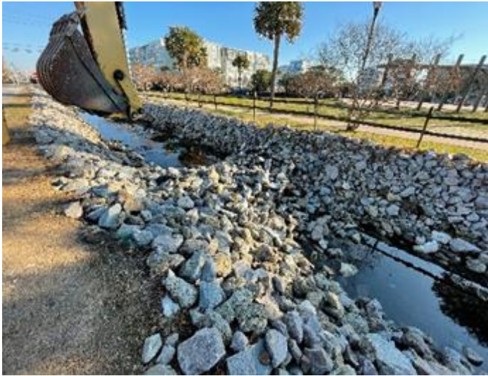
Town Crews cleaned and repaired ditch at Atlanta Ave Lake Park.