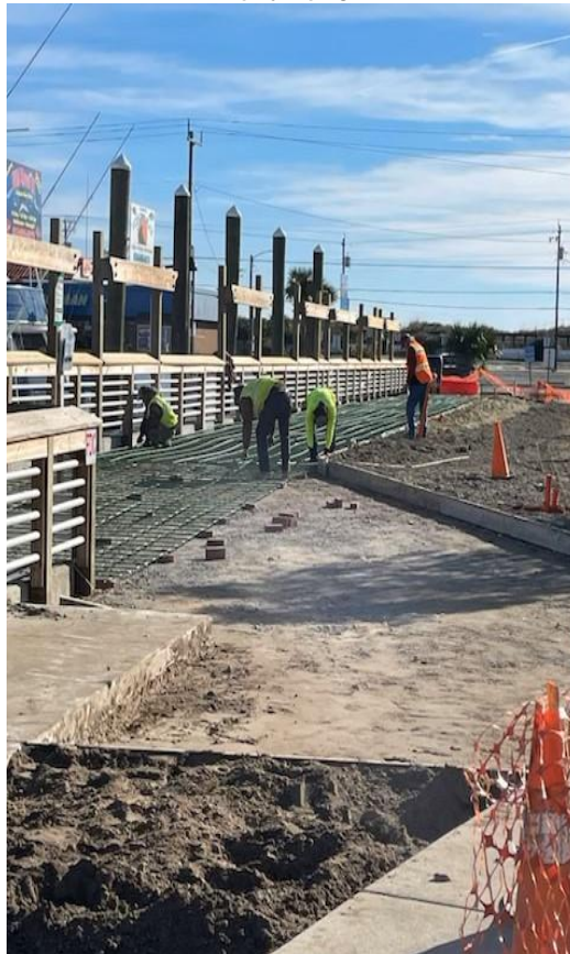
Marina project progress