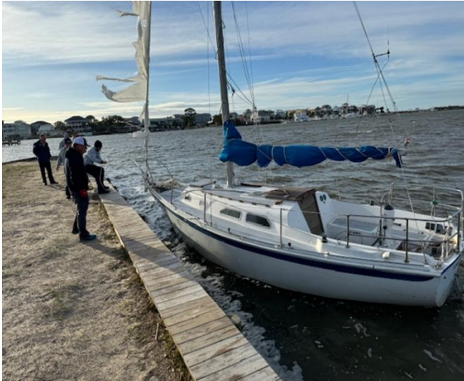
Abandoned Derelict Vessel (ADV) adrift in Snows Cut