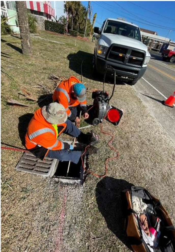
Crews inspect South Lake Park Blvd.