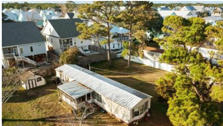
Demolition: 1418 Mackerel Lane – Mobile Home