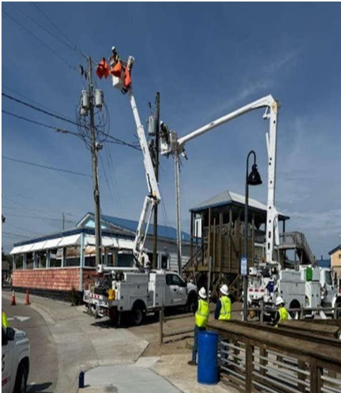
Duke Energy installed power pole at Marina.