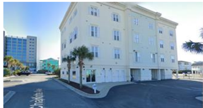
103 Charlotte – Sea Creature Supplies and Rare Goods