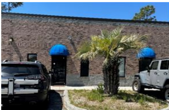
1003 Bennet Ste K – Fitness Studio and Personal Training