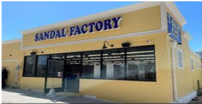
6 Harper – Sandal Factory of Carolina Beach