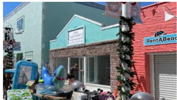
105 CBAN – Snow Cones