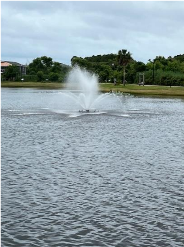
Stormwater Crews install second fountain at the lake.