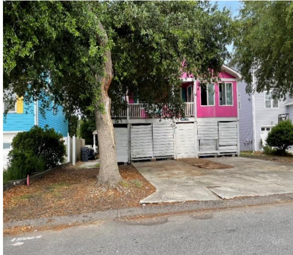
925 Carolina Sands Dr – Demo single-family House and rebuild through NC ReBUILD