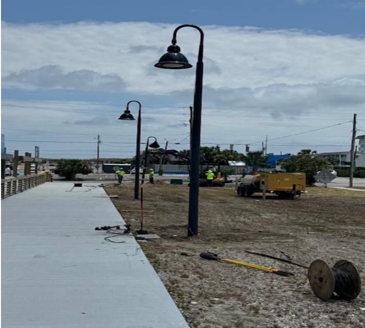
New lights along emergency access area