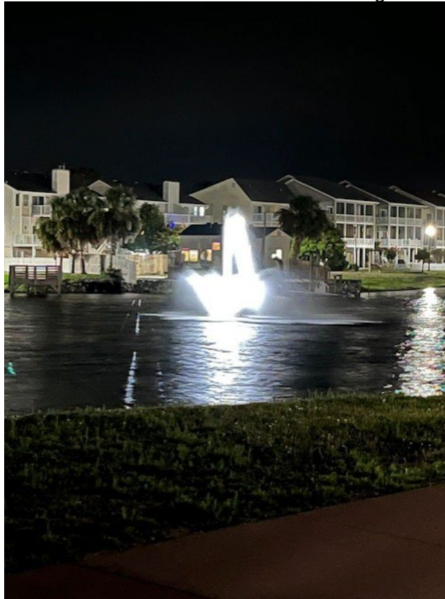
Lake Park fountains illuminated at night.