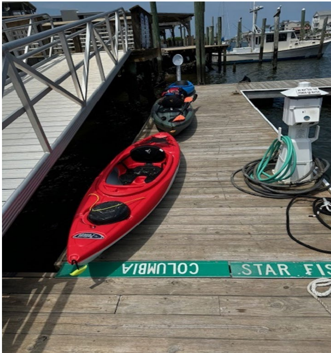
Kayaks should be left in water, tied to dock on SE and SW area of marina