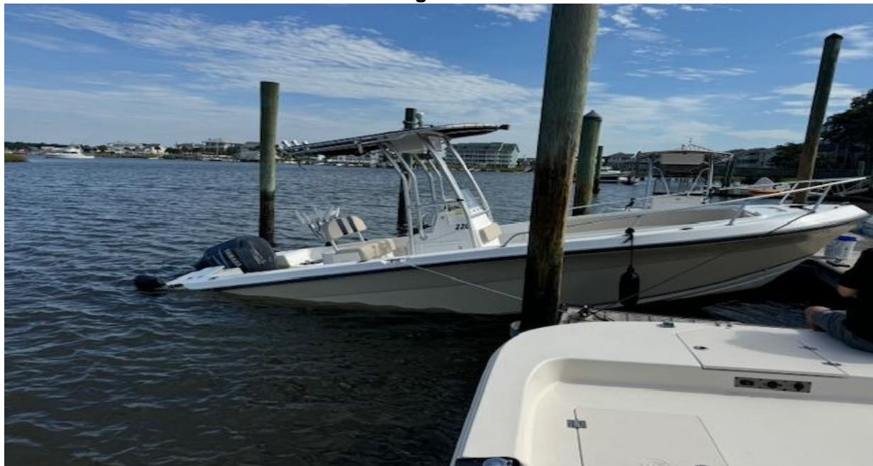
Boat sinking off of Canal Drive.