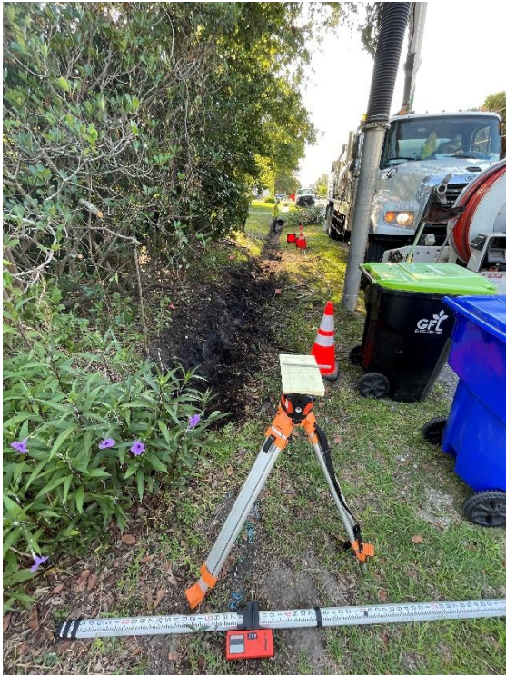
Stormwater crews continue opening the ditch on the 500 block of Greenville Ave.