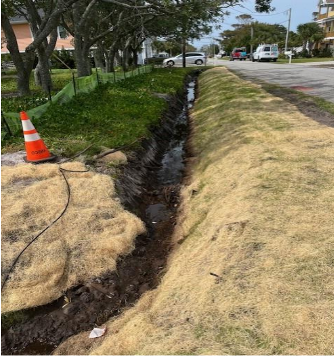
A new stormwater ditch has been added at Alabama Ave and Swordfish Lane.