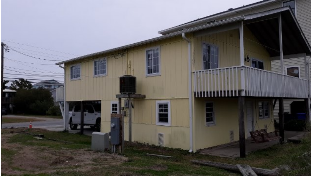
RIGHT SIDE VIEW 12/21/2019

If submitting more photographs than will fit on the preceding page, affix the additional photographs below. Identify all photographs with: date taken; "Front View" and "Rear View" and, if required, "Right Side View" and "Left Side View." When applicable, photographs must show the foundation with representative examples of the flood openings or vents, as indicated in Section A8.