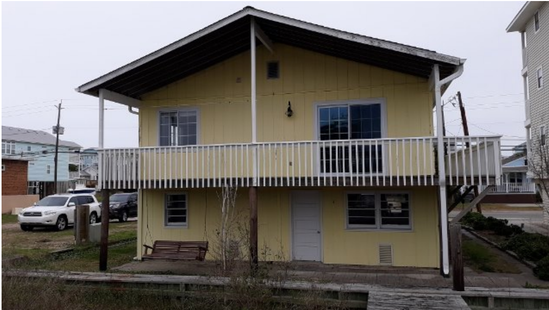
REAR SIDE VIEW 12/21/2019