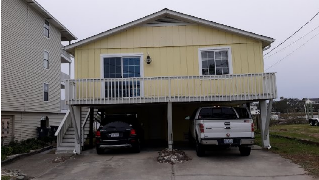
FRONT SIDE VIEW 12/21/2019

If using the Elevation Certificate to obtain NFIP flood insurance, affix at least 2 building photographs below according to the instructions for Item A6. Identify all photographs with date taken; "Front view" and Rear view"; and, if required, "Right Side View" and "Left Side View." When applicable, photographs must show the foundation with representative examples of the flood openings or vents, as indicated in Section A8. If submitting more photographs than will fit on this page, use the Continuation Page.