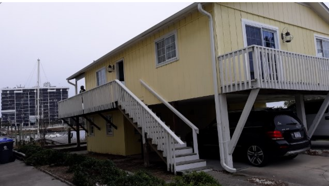
LEFT SIDE VIEW 12/21/2019