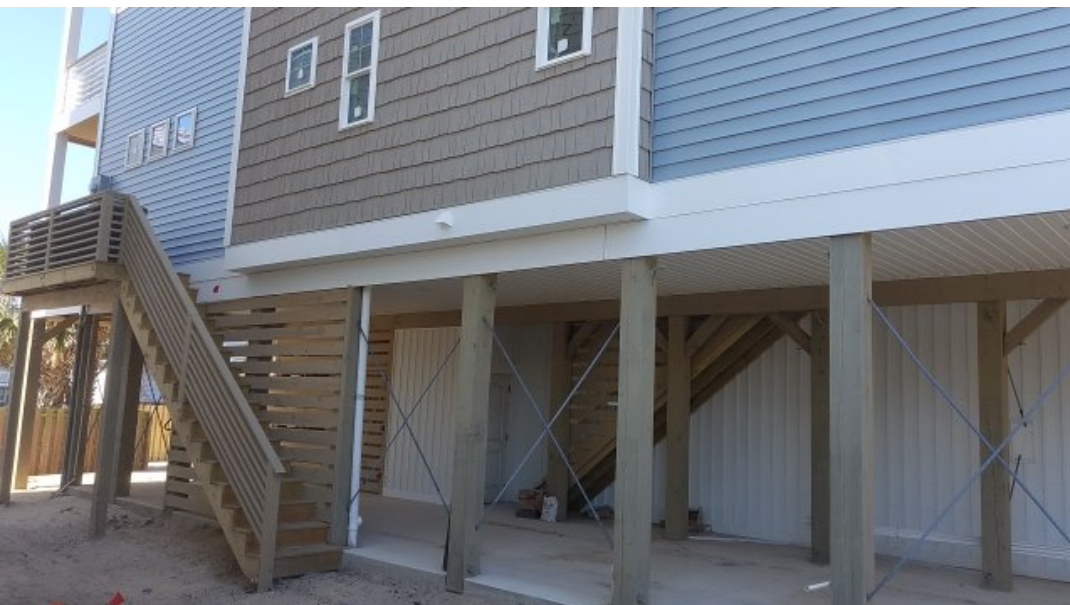
LEFT SIDE VIEW 3/07/2019