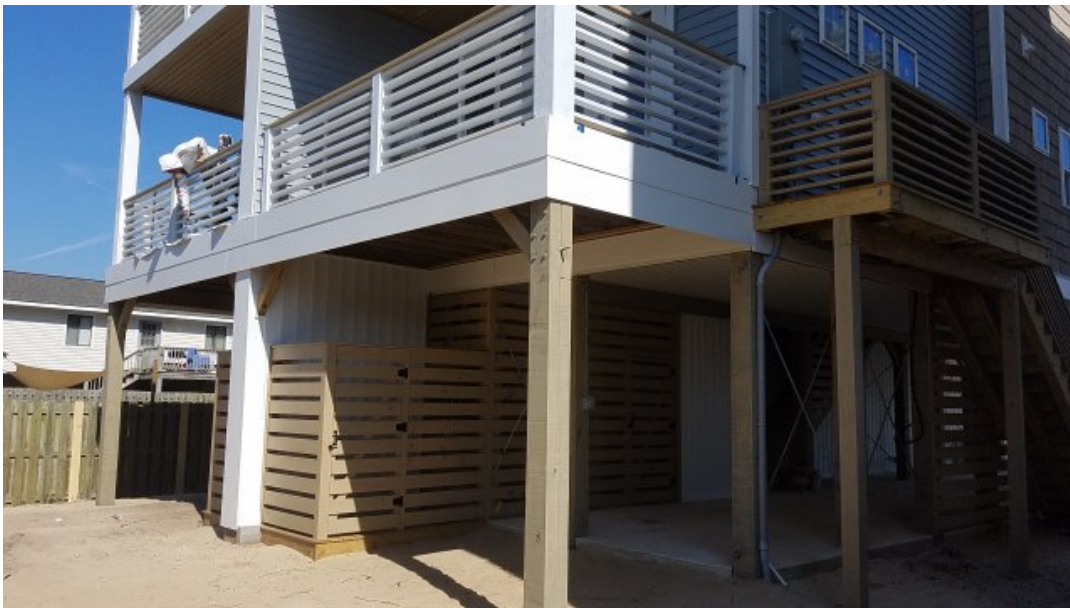
REAR SIDE VIEW 3/07/2019