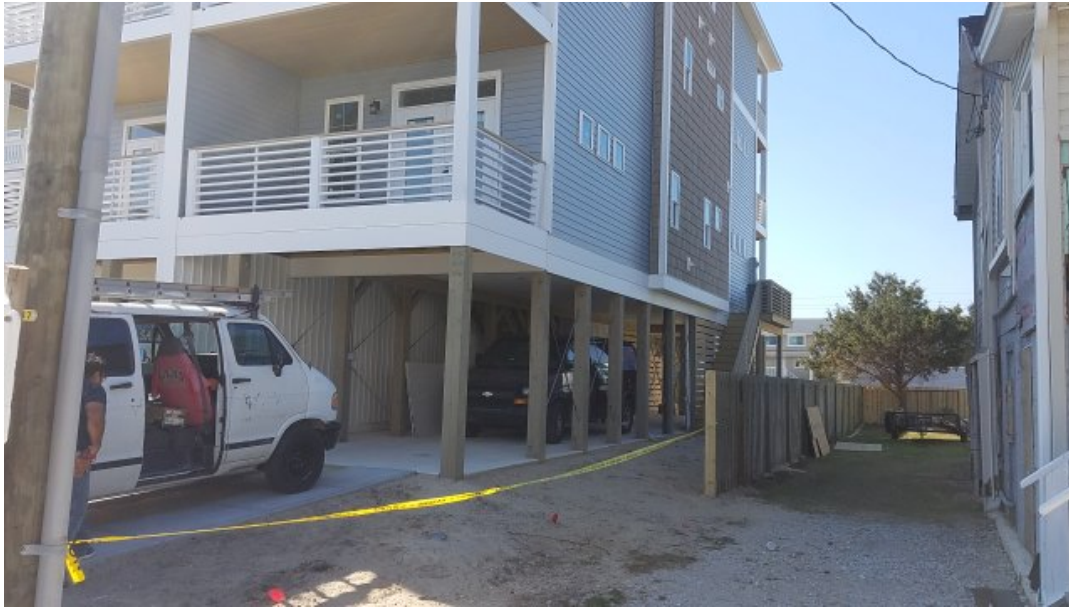
RIGHT SIDE VIEW 3/07/2019

If submitting more photographs than will fit on the preceding page, affix the additional photographs below. Identify all photographs with: date taken; "Front View" and "Rear View" and, if required, "Right Side View" and "Left Side View." When applicable, photographs must show the foundation with representative examples of the flood openings or vents, as indicated in Section A8.