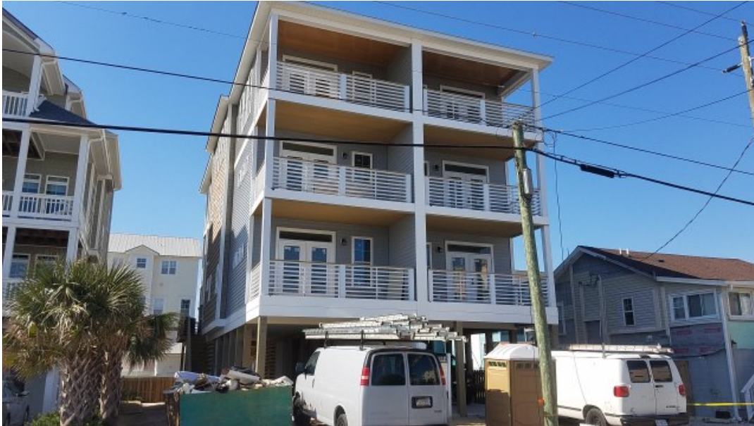
FRONT SIDE VIEW 3/07/2019

If using the Elevation Certificate to obtain NFIP flood insurance, affix at least 2 building photographs below according to the instructions for Item A6. Identify all photographs with date taken; "Front view" and Rear view"; and, if required, "Right Side View" and "Left Side View." When applicable, photographs must show the foundation with representative examples of the flood openings or vents, as indicated in Section A8. If submitting more photographs than will fit on this page, use the Continuation Page.