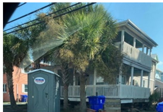
708 Canal Drive