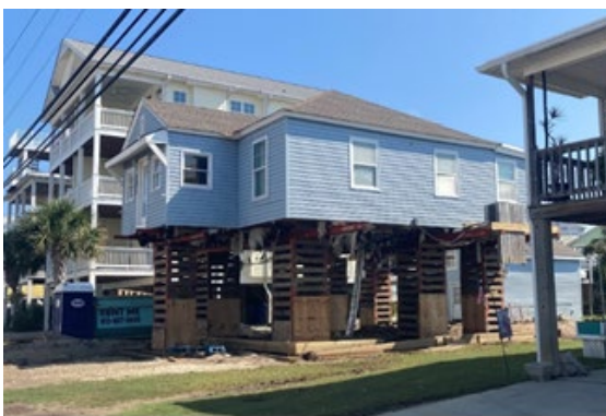
1202 Canal Drive