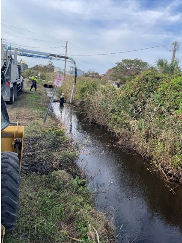
Crews cleaned out ditch on Greenville Ave. and South 2 nd St.